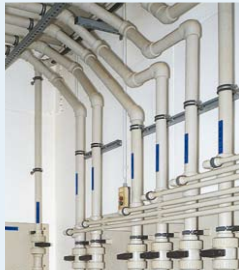
Process and house vacuum in (β)-PP-H.