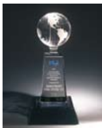
INTEL 2003 Supplier Continuous Quality Improvement Award (SCQI)

UPW. Ultrapure Water (UPW) and Hot Ultrapure Water (HUPW) are the lifeblood of semiconductor wet processing. UPW contacts the wafer at least 20% of the manufacturing cycle. The primary uses for UPW and HUPW are rinse water, humidification water, CMP and ultrapure chemical blending. SYGEF® Plus systems out of PVDF high purity material with the corresponding IR® Plus fusion technology offers an industrial benchmark solution.