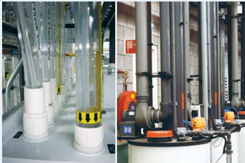
Chemical distribution with flexible tubing in SYGEF® PFA or PVC-U.